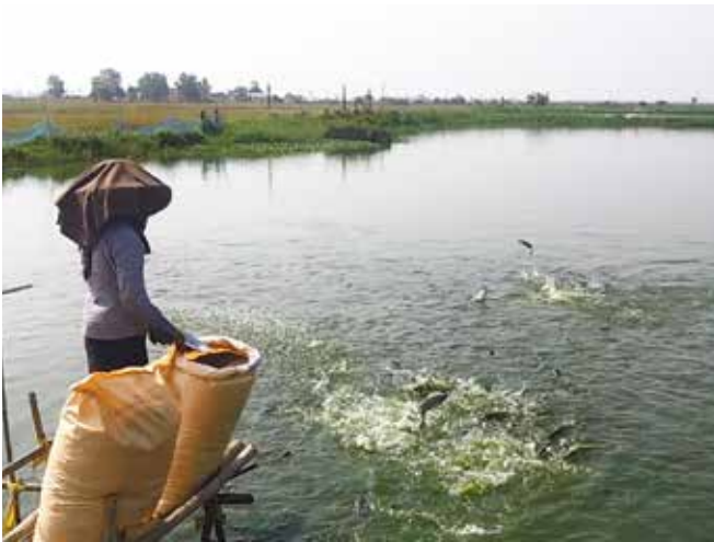
Hand feeding extruded feed