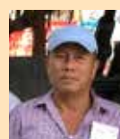
U Tint Swe