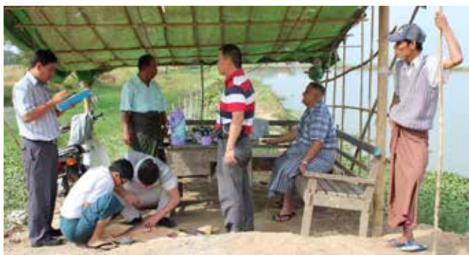
Checking health status of fish

a result, HT has earned accolades such as government recognition, awards and authorised patents.