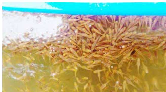
12-days post hatch fry