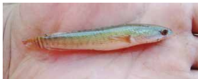
Juvenile C. striata (one day after weaning)