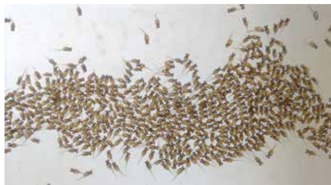
The hatched one-day old larvae (DAH1) of C. striata

In 2012, the artificial breeding of C. striata was carried out and extruded snakehead feed was used under the guidance of Hiner experts for the first time in Myanmar. Through these co-operative undertakings, HT's technical team has been able to accumulate some successful experiences and made revolutionary headway on larvae breeding and extruded snakehead feed.