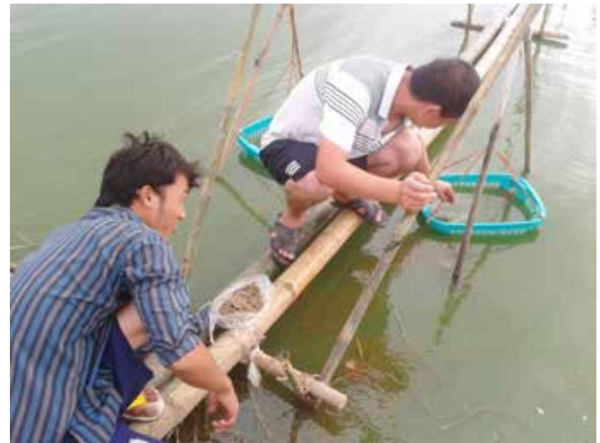
Monitoring fish growth

some difficulties with local conditions - a harsh rainy season and high temperatures in summer. In addition, initially, local labour were not experienced enough to handle the fish and even some breeding tools required for the breeding work needed to be imported from China. Finally, the team managed to successfully produce one million juveniles.