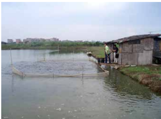
Feeding the fish with extruded feed