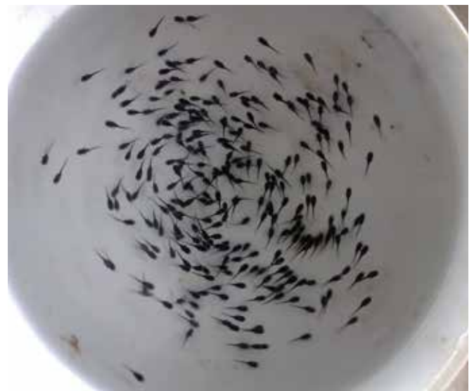
Hybrid snakehead fry

When some of these problems are resolved, the snakehead fish industry is expected to develop positively. In addition, the success in snakehead fish farming and experiences from China are good examples for the development of the same industry in other Southeast Asian countries. The Hinter international service team is sharing their knowhow on snakehead fish farming in Vietnam, Myanmar, Cambodia and other countries.