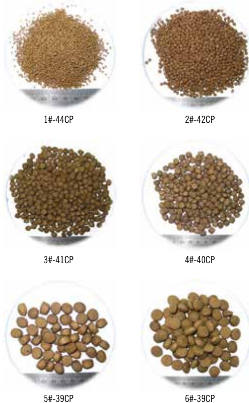
Extruded feed for the snakehead fish from 44-39% crude protein