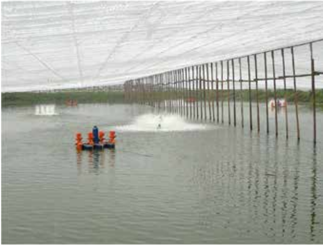
A greenhouse system for vannamei shrimp ponds