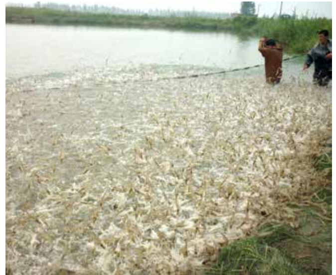
Harvesting vannamei shrimp

To prevent EMS outbreaks, farmers tried many methods, such as improving pond conditions, increasing water exchange, decreasing stocking density, and using many pond additives for shrimp health to combat EMS. Many of these did not work. Biofloc technology is still a relatively new culture technology for most farmers. Polyculture with fish is workable but is only popular in eastern Guangdong province and in the west of Fujian province. Here, farmers stock shrimp with tilapia, grass carp, common carp, catfish and short-neck clam in brackish water pond at various densities.